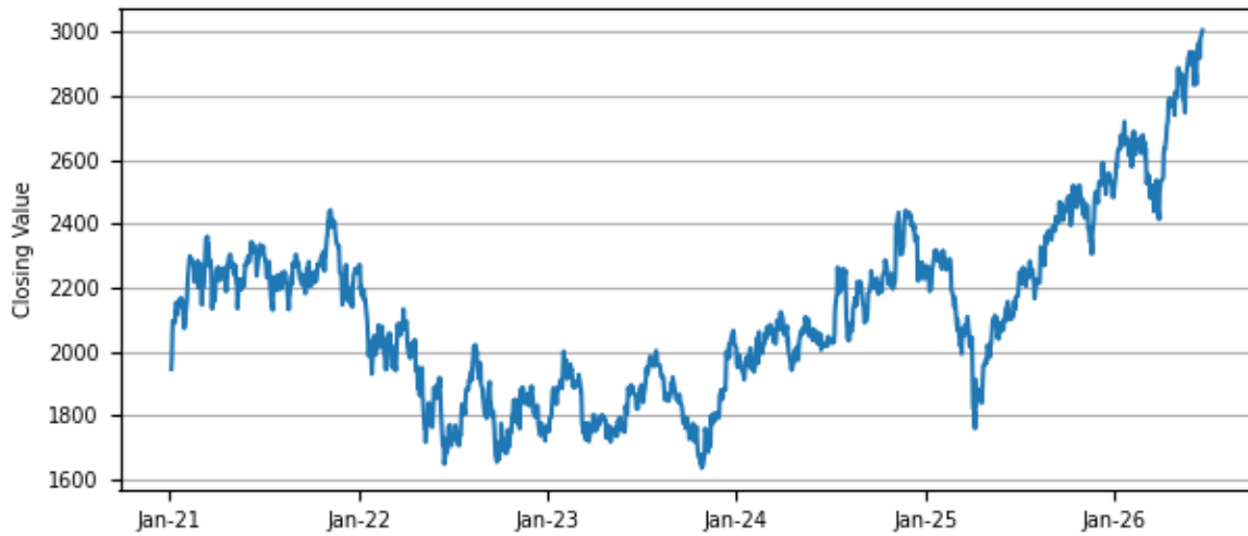
Historical Performance of the RTY

The historical levels of the RTY should not be taken as an indication of future performance, and no assurance can be given as to the closing level of the RTY on any coupon observation date, including the determination date.