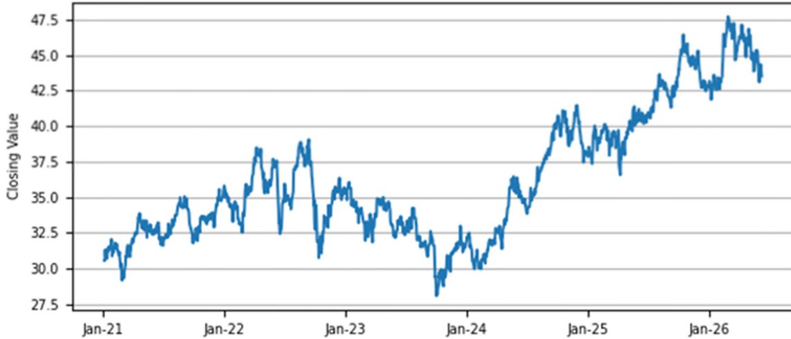
Historical Performance of the XLU

The historical values of the XLU should not be taken as an indication of future performance, and no assurance can be given as to the closing value of the XLU on any coupon observation date, including the final valuation date.