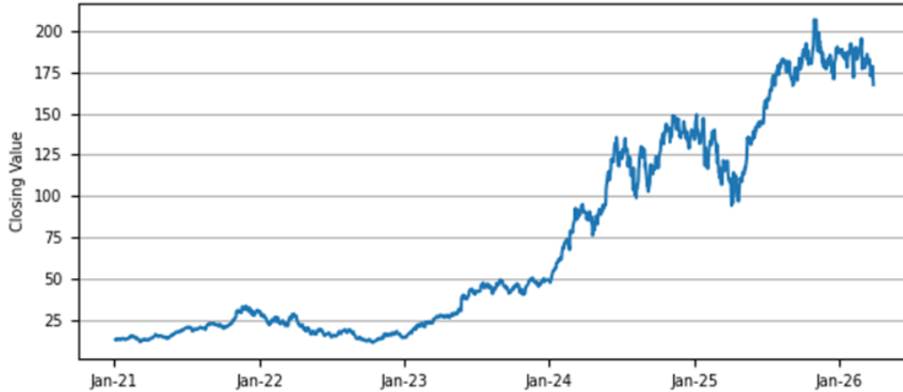
Historical Performance of the common stock of NVIDIA Corporation

The historical values of the common stock of NVIDIA Corporation should not be taken as an indication of future performance, and no assurance can be given as to the closing value of the common stock of NVIDIA Corporation on any observation date, including the final valuation date.